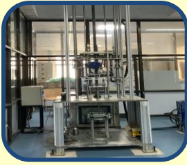
Impact testing Machine