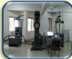
Quarter Car Test Rig