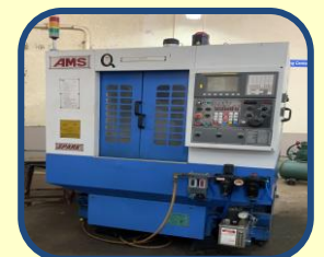
CNC Milling Center