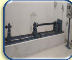
Dual Rotor shaft Test Machine