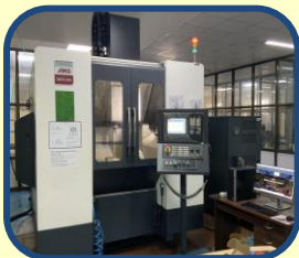
5-Axis CNC Machine