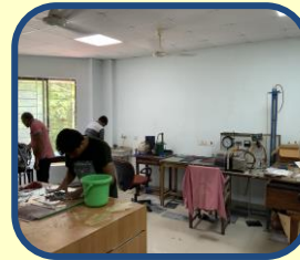
Polymer composite – Preparation and testing