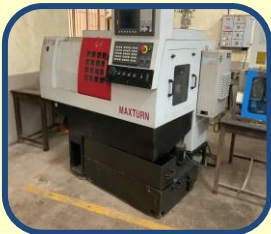
CNC Turning Center