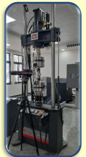
Fatigue Testing Machine